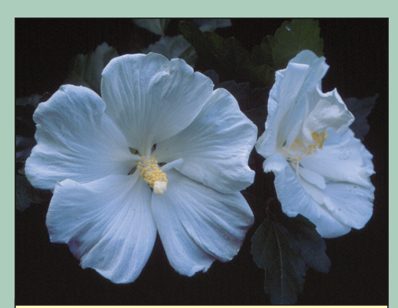
'Diana' Rose of Sharon

Nearly seedless triploid selection with darkgreen leaves, clear-pink, heavily ruffled flowers with dark-red eyespot.