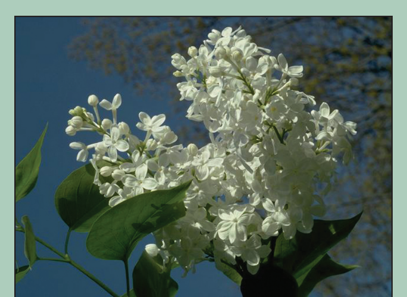
'Betsy Ross' lilac Syringa 'Betsy Ross'

Glossy dark-green foliage, creamy-white flowers, and abundant bright-orange-red fruit. Highly tolerant to scab and fire blight.