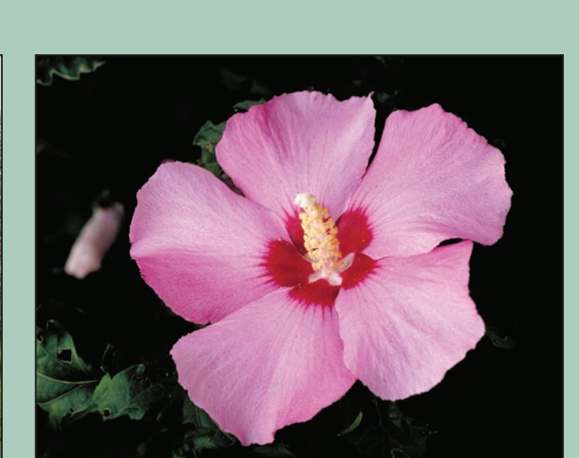
'Aphrodite' Rose of Sharon

Seedless selection with dark-green, heartshaped leaves and dazzling bright rosy-pink floral display in early spring.