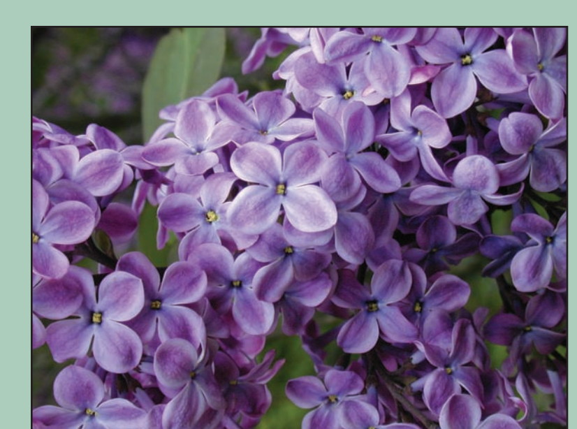
'Old Glory' lilac Syringa 'Old Glory'

Medium-green foliage, large striking reddishpurple fragrant flowers. Recommended for traditional lilac-growing regions.