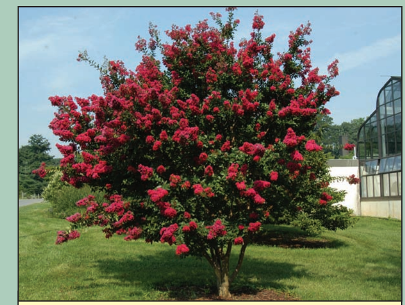
'Tonto' crapemyrtle Lagerstroemia 'Tonto'

Distinctive miniature hybrid with mildewresistant dark-green foliage with maroon tinge and deep-rose pink flowers.