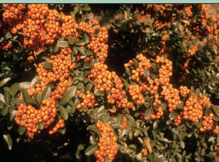
'Mohave' firethorne Pyracantha 'Mohave'

Glossy dark-green semi-evergreen foliage, creamy-white flowers, shiny bright-red fruit. Compact slow-growing selection that is highly tolerant to scab and fire blight.