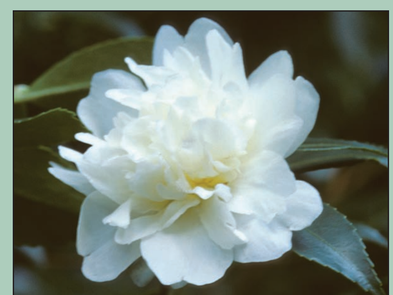
'Snow Flurry' camellia

Unique variegated green foliage with cream-colored margins. Small white fruit produced in early fall.