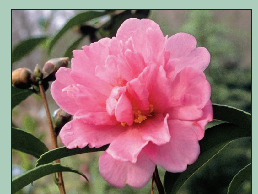
'Winter's Charm' camellia

Cold-hardy fall-blooming selection with glossy dark evergreen foliage and pure-white double flowers.