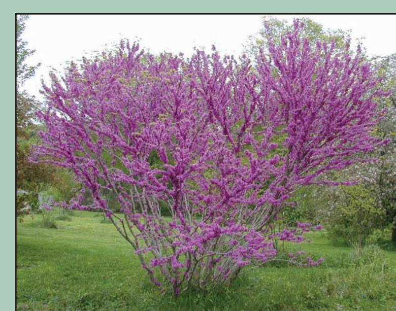
'Don Egolf' redbud

Cold-hardy selection with glossy dark evergreen foliage and a profusion of double pink flowers in the fall.